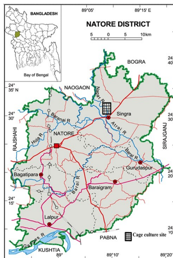
FIGURE 1 Cage fish farming experimental site in the Atrai River of Chalan Beel, Bangladesh (modified from Google map).

desh (Figure 1). The study was conducted for a period of four months from 1 July to 28 October 2020.