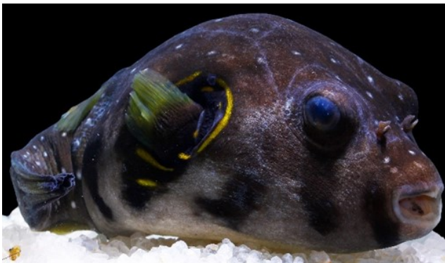
FIGURE 2 Live photograph (ex-situ) of Arothron hispidus from Frasergunj fishing harbour, West Bengal, eastern India: ZSI F 13589/2.

Arothron spp. are known for their polychromatic colouration at the intraspecies level and different life stages, making it difficult to identify them through pictures (Su and Tyler 2017; Bariche et al. 2018). There also exists high variability among populations from different regions. Randall et al. (2012) examined the variability of A. hispidus between the Red Sea, Indian Ocean and Pacific Ocean populations. They commented that sexual dichromatism could play a role in such variations. The individuals collected from West Bengal seems to be sub-adults, for they have fewer white spots on their body, and also, the circles around the eyes are incomplete (Figure 2).