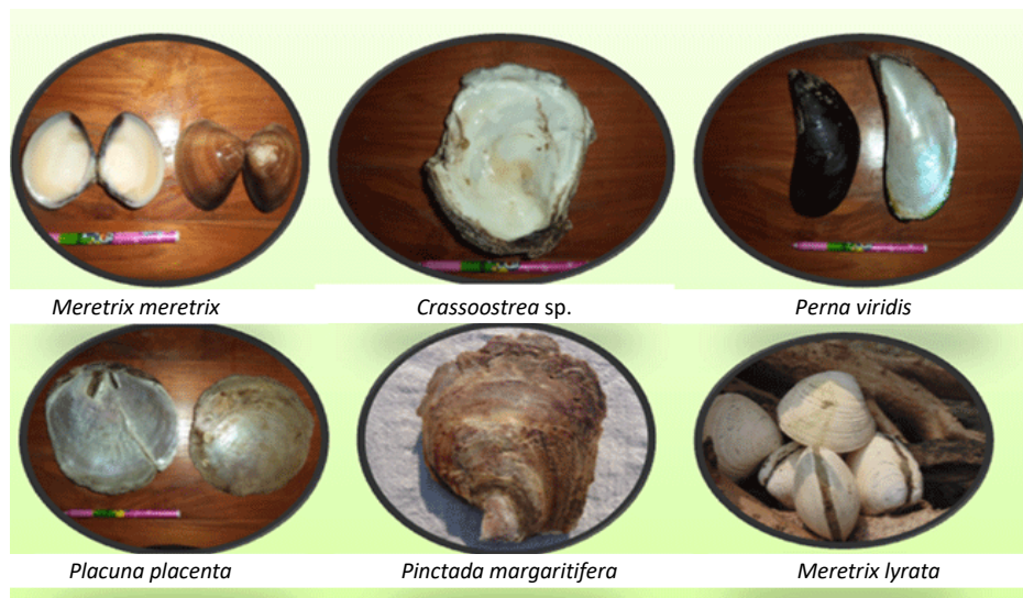
Figure 2: Bivalve identified during the study period

Availability of marine bivalves: During the study period a total 7 species of marine bivalve were collected from 6 sampling areas of the Sonadia and Moheshkhali, Cox’s Bazar, and Kuakata, Patuakhali (Table 1, Figure 2). During the sample collection, water quality parameters were studied to understand the environment of that area. The salinity ranged between 18 to 34 ppt. The pH of water was slightly alkaline and ranged from 8 to 8.5. The water depth was 0.2 to 2.0 meter and the bottom structure was muddy, sandy and rocky.