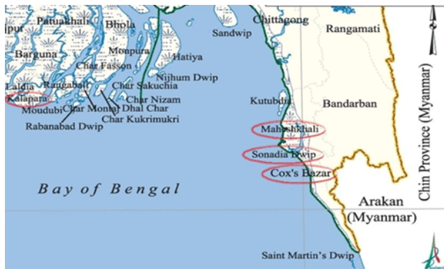
Figure 1: Study area for pearl producing oyster collection

Sampling sites: The study was conducted in the Sonadia, Moheshkhali in Cox’s Bazar and Kuakata in Potuakhali (Figure 1). The primary criterion for the selection of this area was suitable geographical coverage for large variety of pearl producing marine oysters and presence of good numbers of bivalve collectors.