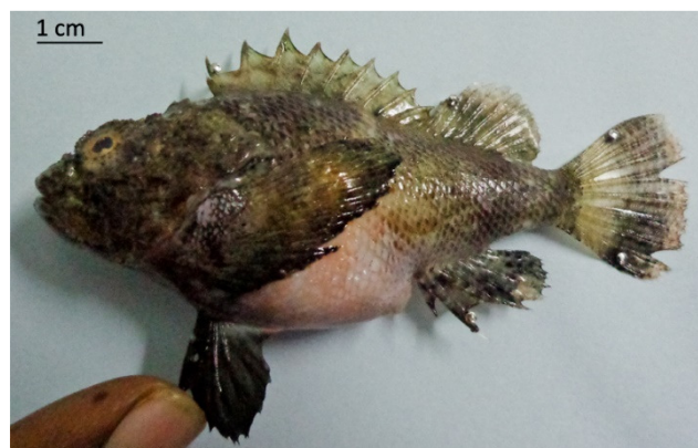
FIGURE 1 Shows the Scorpaenopsis macrochir Ogilby, 1910, 96 mm, TL collected from Visakhapatnam fishing harbour, coast of India

band, widely separated at symphysis by a fleshy knob and ridge that are part of a skinny transverse membrane across mouth between jaw and vomer, its middle part black. Inner front of teeth enlarged, retrose. In lower jaw similar teeth in band, barely separated at symphysis, inner series of teeth enlarged, retrose a black patch behind front teeth. An irregular inverted V-shaped patch of palate tooth on vomerine; tongue apically free, narrowly rounded. Eyes are moderately, interorbital ridges present; interorbital space broad, a very deep triangular shape of pit below anterior part of orbit. Head and body variably with few to many cilia, at the extreme whole head with filaments, the longest at supraocular spine, also over body; outer ring of iris with fleshy processes some trifoliate; interorbital space moderate, exceeding eye; no coronal ridges.