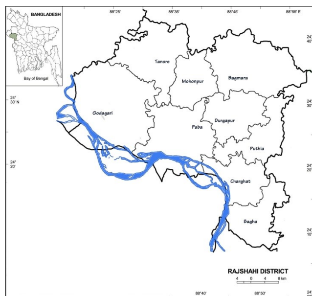
Figure 1: Map of Rajshahi district showing the study area, the Padma River (blue colored).

Sampling area and duration: Samplings were conducted in the Padma River at the Rajshahi City Corporation area (Latitude 24° 22' North; Longitude 88° 35' East) (Figure 1). Fish specimens were collected for seven months from May 2012 to November, 2012.