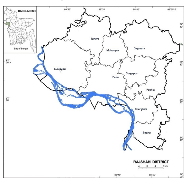
Figure 1: Map of Rajshahi district showing the study area, the Padma River (blue colored).

Sampling area and duration: Samplings were conducted in the Padma River at the Rajshahi City Corporation area (Latitude 24° 22' North; Longitude 88° 35' East) (Figure 1). Fish specimenswere collected for seven months from May 2012 to November, 2012.